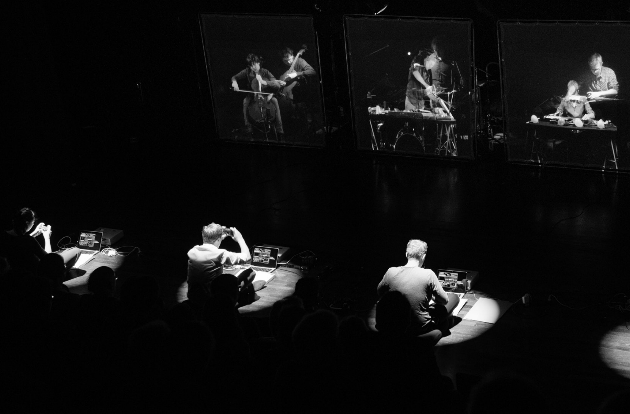
Nadar Ensemble performing Generation Kill